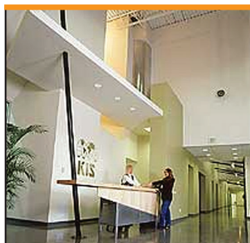
Kiosk Information Systems' world headquarters.

SmartPro 550 USB WatchDog UPS Systems protect KIS's kiosk CPUs against damaging power surges and audio/video distortion due to line noise.