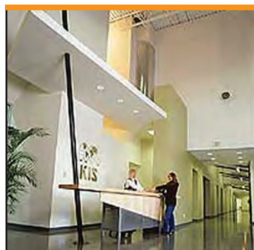
Kiosk Information Systems’ world headquarters.

SmartPro 550 USB WatchDog UPS Systems protect KIS’s kiosk CPUs against damaging power surges and audio/video distortion due to line noise.