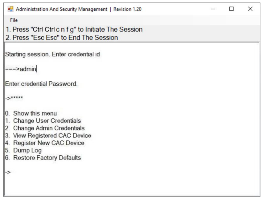
Figure 7: Administrator Log-in