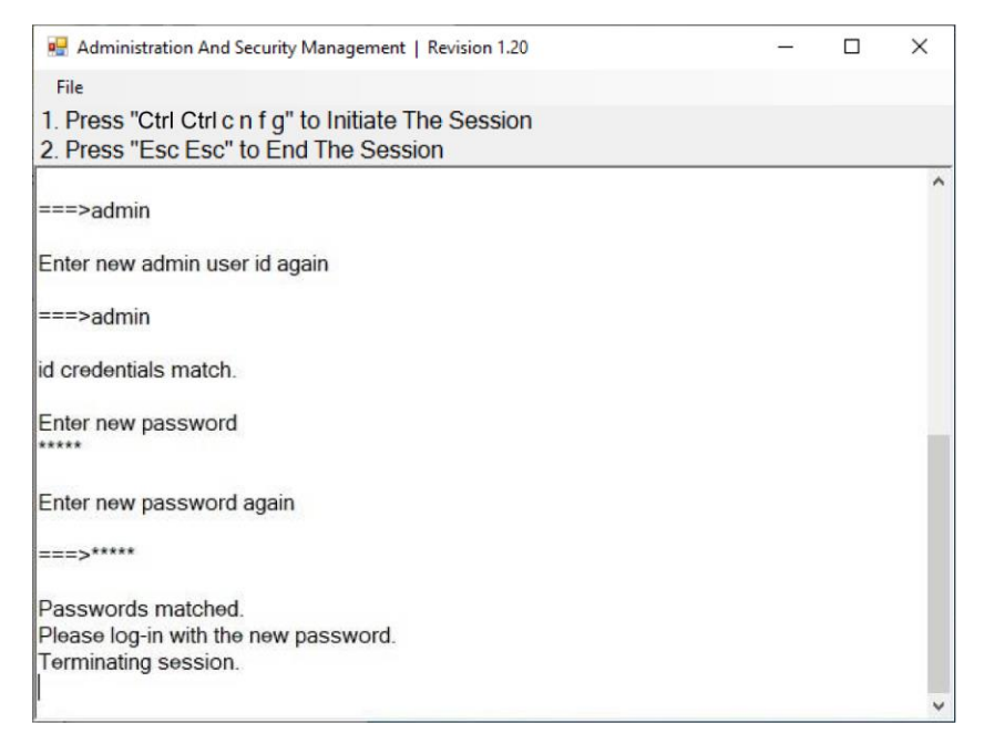
Figure 11: Admin Change Admin Credentials